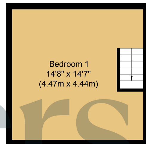
Third Floor Approximate Floor Area 214 sq. ft (19.84 sq. m)

Whilst every attempt has been made to ensure the accuracy of the floor plan contained here, measurements of doors, windows, rooms and any other items are approximate and no responsibility is taken for any error, omission, or mis-statement. The measurements should not be relied upon for valuation, transaction and/or funding purposes. This plan is for illustrative purposes only and should be used as such by any prospective purchaser or tenant. The services, systems and appliances shown have not been tested and no guarantee as to their operability or efficiency can be given.